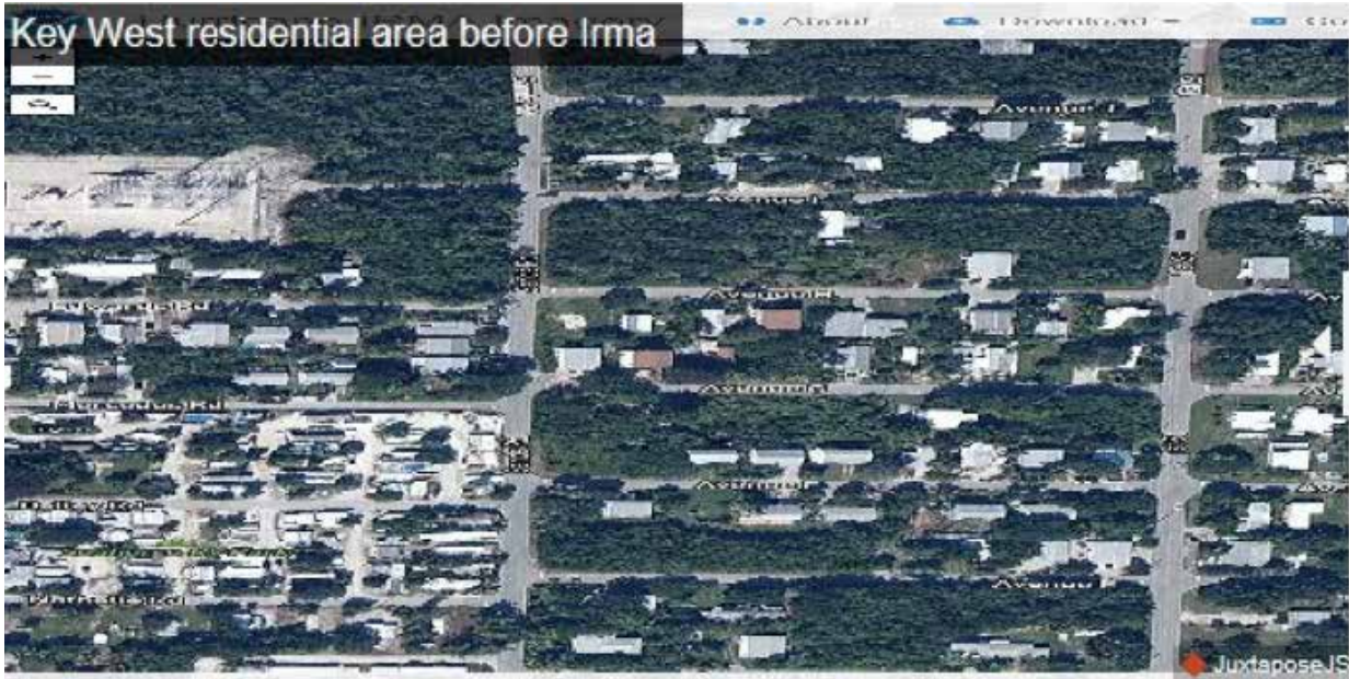
Photo Credits: Before MapBox/DigitalGlobe After MapBox/DigitalGlobe