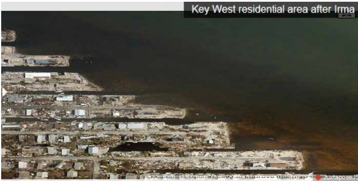
Photo Credits: Before MapBox/DigitalGlobe After MapBox/DigitalGlobe